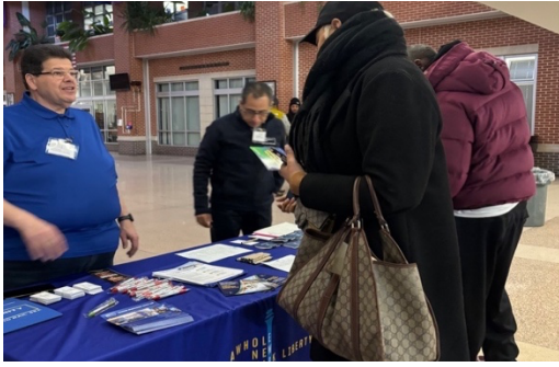
Port Authority team members from the Office of Diversity, Equity, and Inclusion and the EWR Outreach Team sharing information to attendees