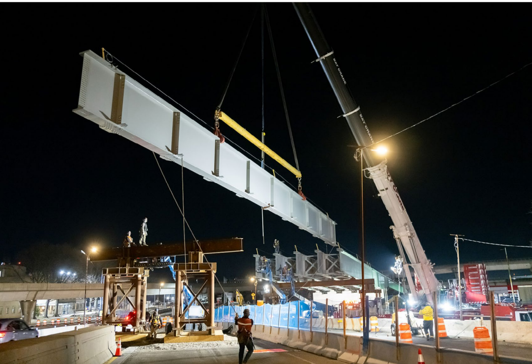
Steel Erection of J34 Steel Bridge Work, Major Event for Westbound Connector Project